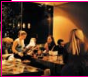
Two nights bed and breakfast, with Stena Line low season for a car and two people £211 per person