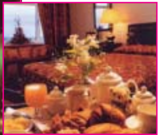
Two nights bed and breakfast, with Stena Line low season for a car and two people £230 per person