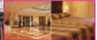
Two nights bed and breakfast, with Stena Line low season for a car and two people £203 per person