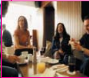
Two nights bed and breakfast, with Stena Line low season for a car and two people £205 per person